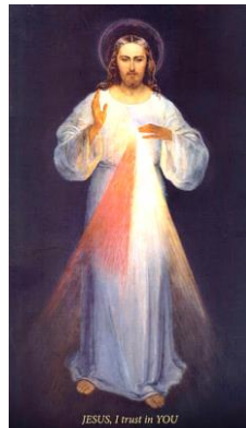
The original Divine Mercy image

Symbolic meaning: The coloured rays streaming out from the heart of Jesus have symbolic meaning... red for the Blood of Jesus, which is the life of souls, and white for the Baptismal water which justifies souls. The brightest point in the picture is the heart. The light on the forehead signifies the presence of the Father. - The whole image is symbolic of the mercy, forgiveness and love of God.